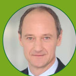
Dr. Roland Busch

Member of the Managing Board of Siemens AG